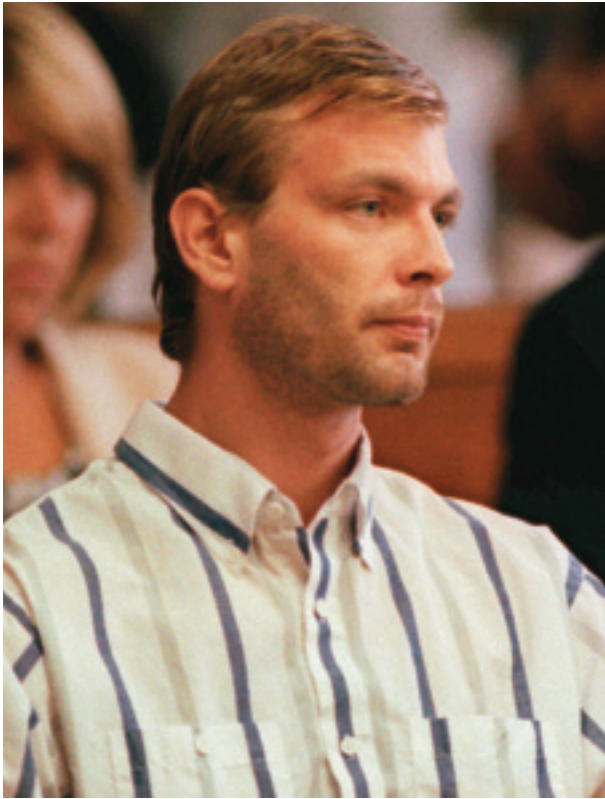
● Jeffrey Dahmer, convicted serial killer and cannibal. Forensic psychologists work with the legal, court and correctional systems by developing criminal profiles and assisting in decisions about the disposition of convicted offenders.