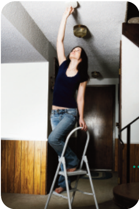
According to research conducted by Latané and Darley, the presence of other people affects our perception of an emergency situation.

Psychology uses scientific methods to investigate its subject. Many of these methods are discussed in detail in Chapter 2. Despite its careful methodology, however, many questions about behavior remain unanswered by the science of psychology. Much of our understanding of people and behavior is subject to constant review and revision. You will learn that very few psychological principles are carved in stone; new theories as well as technological developments are constantly providing fresh directions and methods for expanding knowledge.