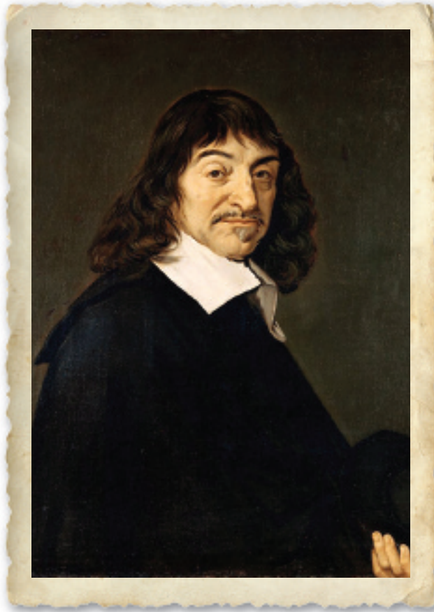
René Descartes (1596–1650)

For instance, the influential seventeenth-century philosopher René Descartes proposed that mind and body are distinct entities that interact at a point represented by the brain's tiny pineal gland. Descartes' position was known as dualism . He believed that the physical body was mechanical and obeyed known laws of physics. The mind or soul, however, was not physical but interacted in some way through the pineal gland to produce intentional behavior. Descartes' dualistic view is summarized in the following statement: